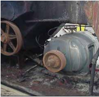
Old unit stripped down for full rebuild at our own shop.