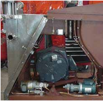
New components installed, all stainless steel cleaned/polished.