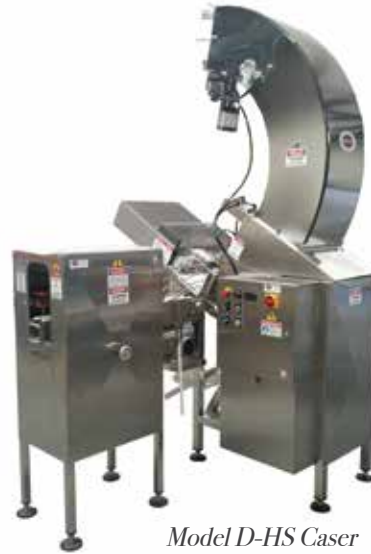
Model D-HS Caser