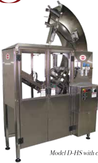
Model D-HS with enclosure